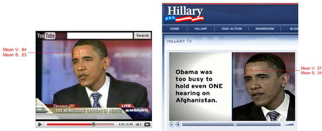
Figure 3: Video still capture from original MSNBC footage (via YouTube) and ad on Clinton campaign website

The images in Figure 3 above show video stills that I captured from the Clinton campaign website and the original MSNBC footage (from YouTube). The package includes the polygons that correspond to the facial coordinates of Obama's face in each image clintonpoly and msnbcpoly respectively, so we simply create a new image from those coordinates, make sure the polygon is capturing the correct portion of the image via the plot function, and generate saturation and value readings.