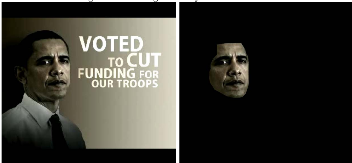
Figure 1: An image and object selected from it

When processing a large batch of images, users may find it more beneficial to go about creating these polygons in a corpus of images by utilizing the interface provided with Bio7 , a Windows and Linux development environment originally designed for ecological modeling, available at http://sourceforge.net/projects/bio7/ . Bio7 provides an excellent interface with which one can outline a polygon in an image and send the image's coordinates to R. With a little bit of scripting, a system can be set up to easily extract the coordinates